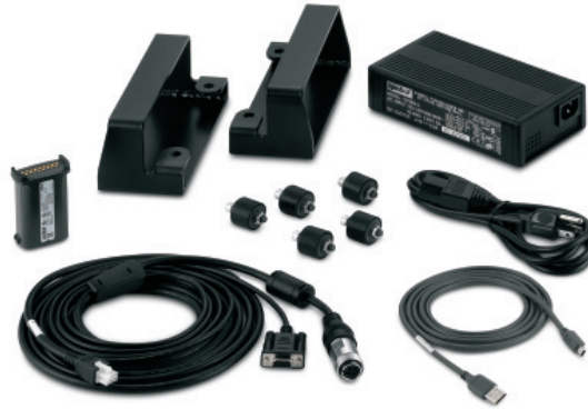
RD5000 Mobile RFID Reader accessories

maximizes your return on investment. An exceptional investment, the device can be easily moved and temporarily mounted from one application to the next — from skate wheel conveyor receiving to pallet jack storage to mobile cart inventory — providing the flexibility to meet multiple and temporary RFID needs throughout the enterprise. Your expanded view of operations enables tighter management control. Present staff can accomplish more throughout the workday, better controlling labor costs. Improved inventory visibility enables a reduction in stocking inventory, as well as in the associated costs and space requirements. And the rugged design ensures maximum uptime — and a low total cost of ownership.